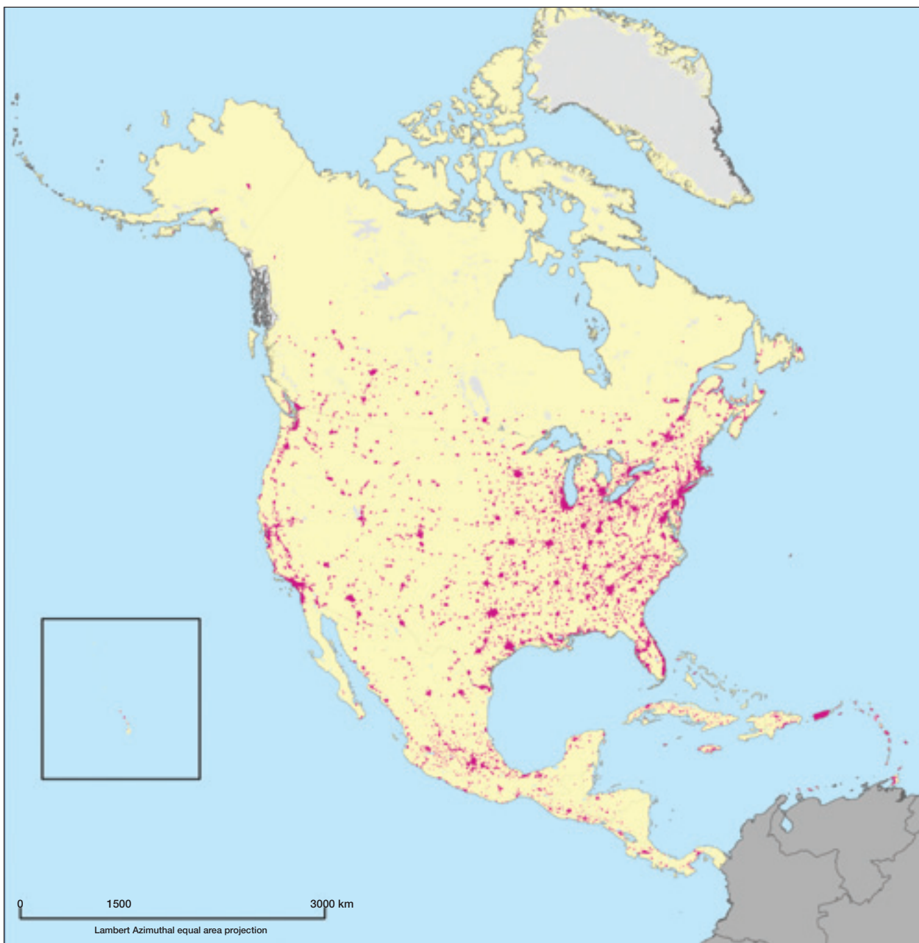
WebFigure 1. Variation in human settlement density (ie urban spatial extent) across the North American continent ( http://beta.sedac.ciesin.columbia.edu/gpw/global.jsp ). Light gray indicates areas for which data are lacking. Location of Hawaiian Islands (inset) is not to scale.