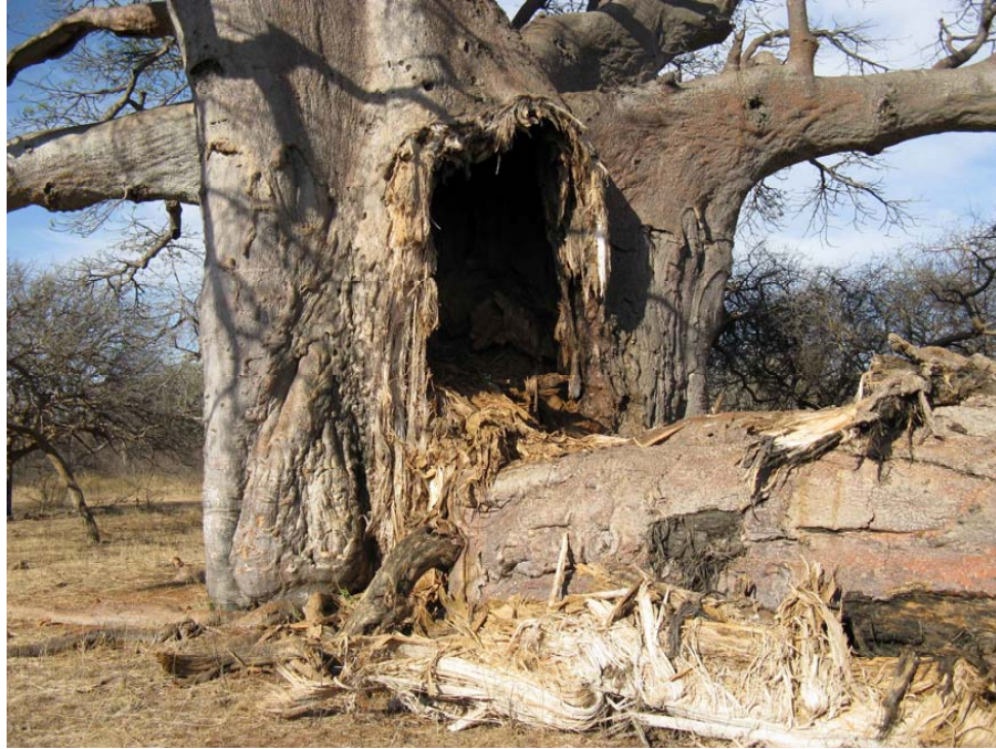
Figure 2 The northern section of the tree showing the cavity evinced after the southern section collapsed

depth of 2.20 m, and a maximum height of 2.70 m (see Figure 2). Investigation of the fallen southern section showed that approximately half of the cavity was located inside this part of the trunk. Eventually, the northern section also split into 2 parts and collapsed in November 2008. Today, the remains of the big baobab are lying on the ground in an advanced stage of decay.