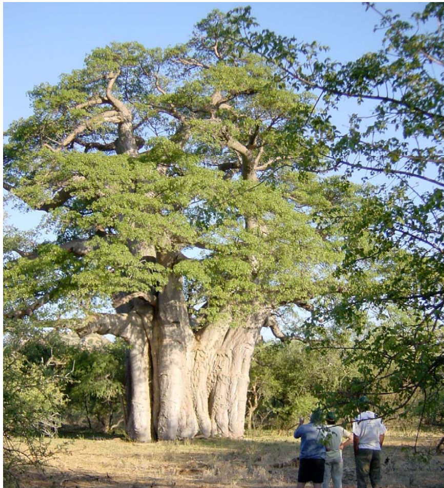
Figure 1 View from west of the Makulu Makete tree prior to its split

The Makulu Makete Wildlife Reserve, located in the northwestern part of Limpopo Province, South Africa, lies adjacent to the border with Botswana. It is the home of several large baobabs. The Makulu Makete tree, called “big tree” or “big baobab” by the owners, was the largest tree in the reserve. It had a height of 24 m, a circumference at breast height (cbh; 1.30 m above ground level) of 22.25 m and an estimated wood volume of \sim 180 \text{ m}^3 , see Figure 1. The GPS coordinates for the site are 22^\circ 34.584'S , 25^\circ 52.261'E , with an altitude of 719 m and mean annual rainfall of 388 mm.