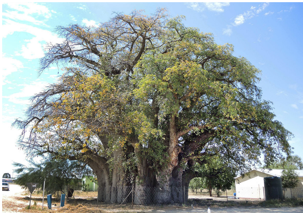
Figure 1. General view of the Big baobab of Outapi from the south-west.

The monumental baobab consists of 8 stems, out of which 4 are false ones [19]. It also has several buttress branches. The baobab exhibits a closed ring-shaped structure, with a false cavity defined by three stems. The false cavity opened some time ago, by the splitting of two stems. The resulting opening occupies an angle of more than 30° of the circumference. The false cavity has a bell shape with a height of 2.95 m and an ellipsoidal base with the axes of 2.24 x 1.88 m ( Figure 2a and 2b ). On the other hand, two false stems are disposed in V-shape with an opening of around 50°. Their lengths at ground level are 2.80 and 3.61 m ( Figure 3 ). Such false stems disposed in V-shape provide better stability in sandy soils.