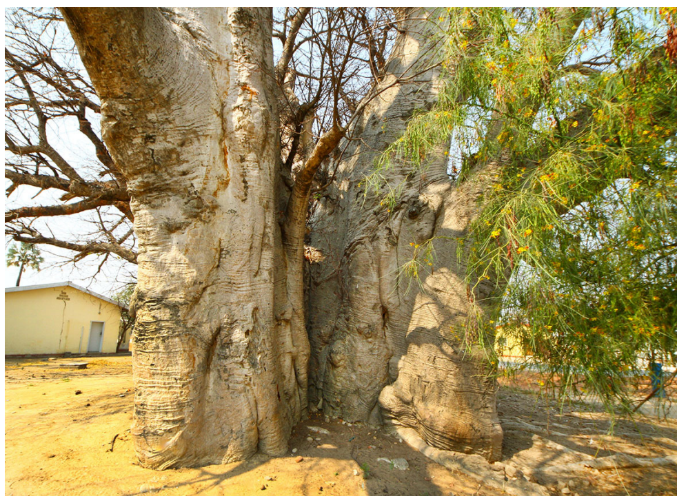
Figure 3. The photograph presents the two false stems disposed in V-shape.

The 1\sigma probability distribution (68.3%) was selected to derive calibrated age ranges. For one segment (BB-1d), the 1\sigma distribution is consistent with one range of calendar years. For other five segments (BB-1b, BB-1c, BB-1e, BB-2x, BB-3x), the 1\sigma distribution corresponds to two ranges of calendar years. In these cases, the confidence interval of one range is considerably greater than that of the other; therefore, it was selected as the cal CE range of the sample for the purpose of this discussion. For obtaining single calendar age values of samples, we derived a mean calendar age of each sample from the selected range (marked in bold). Sample ages represent the difference between the year 2021 CE and the mean value of the selected range, with the corresponding error. Sample ages and errors were rounded to the nearest 5 yr. We used this approach for selecting calibrated age ranges and single values for sample ages in our previous articles on AMS radiocarbon dating of large angiosperms, especially baobabs [7-15, 18-22].