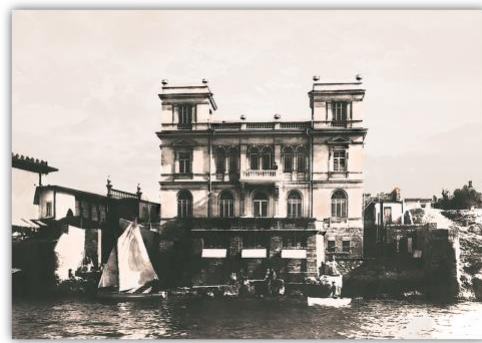
Fig. 1. Sevastopol Biological Station.

For the first decades, the Sevastopol Biological Station rented different premises. In 1892, the Station was transferred to the Imperial Academy of Sciences, and the academicians allocated funds for the construction of a building with a marine aquarium. Since autumn of 1897, the beautiful building in the style of a classic renaissance is a real pearl of the Sevastopol Bay (Figure 1).