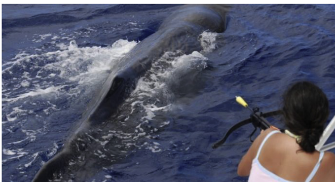
Fig. 2. Minimally-invasive sampling method. Dart-based skin biopsy sampling using a crossbow from a free-ranging sperm whale ( Physeter macrocephalus ) in the North Atlantic Ocean, Portugal.