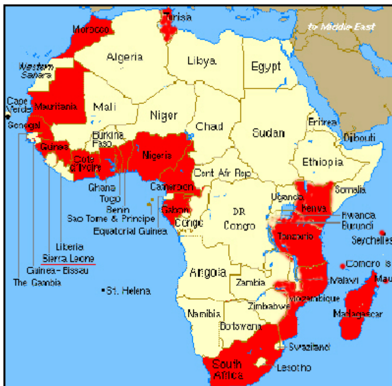
Fig.1 Map showing countries that participated on ODINAFRICA activities marked in red.

The Internet and the Web are constantly influencing the development of new modes of scholarly communication in the way information is gathered, store, organized, accessed, retrieved and consumed. Their potential for delivering goods is quite vast, as they overcome successfully the geographical limitations associated with the print media. Some of the online databases used at the KMFRI library are AGORA, HINARI, OARE, INASP, DOAJ, making the delivery of documents much faster compared to earlier days when mail was the main means of communication; there are of course some challenges that must be addressed to make the process is complete. Electronic resources present the user with vast amounts of information, but there are concerns about the stability of the Internet connection, the need to sort through information to find out which are legitimate sources, and a need to train researchers in the use of e-resources. Some are not satisfied with the existing IT infrastructure within the organization. Some of the impacts of the use of e-resources to the scientists are: