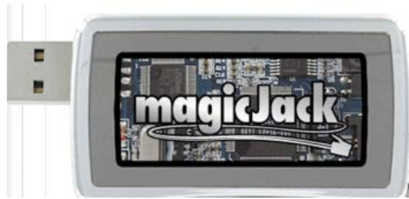
6 cm x 3.5 cm x 1.5 cm

When you first plug in the device there is a relatively painless setup and registration procedure. It is during this procedure that you choose your area code and the first three digits of your phone number. You are then supplied with the remaining four digits to complete a standard ten-digit phone number. You must then plug in a phone. This can be any phone that you would plug into the wall for a landline service (RJ-11 jack). The phone itself can be a corded phone or a cordless phone, it just can't be a cell phone. So instead of plugging the phone into the wall, you are plugging it into the MagicJack which is plugged into your computer. Your computer will also need to have a high speed network connection (Ethernet or wireless). Your computer can not be connected to the network via a modem.