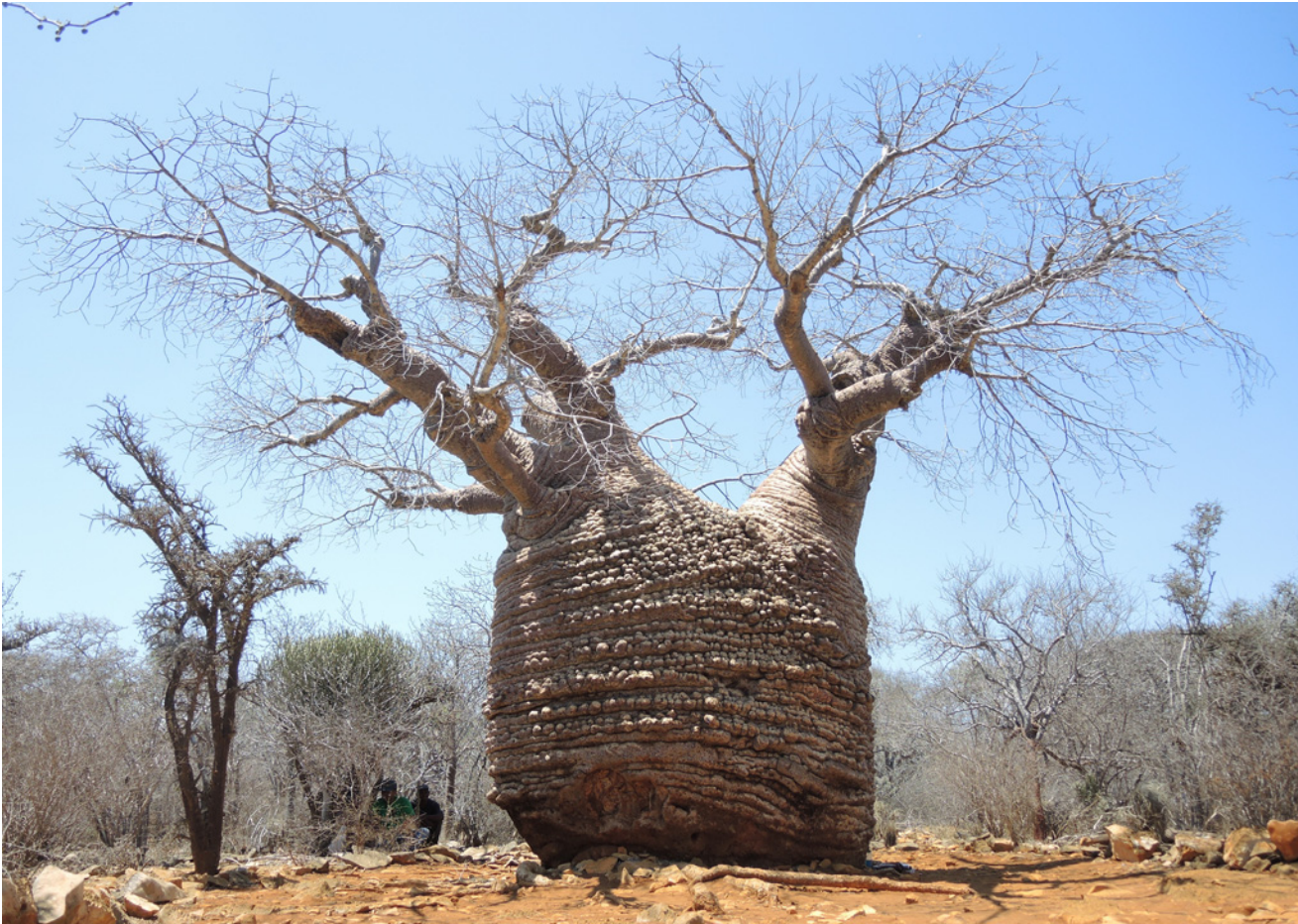
Fig 2. General view of the old Grandmother.