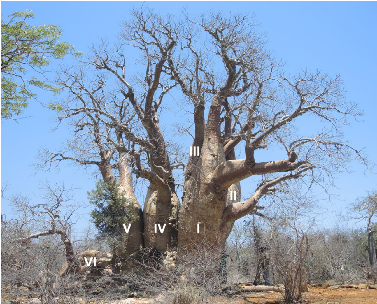
Fig 5. Western view of the polygamous baobab with stem numbering (from I to VI).