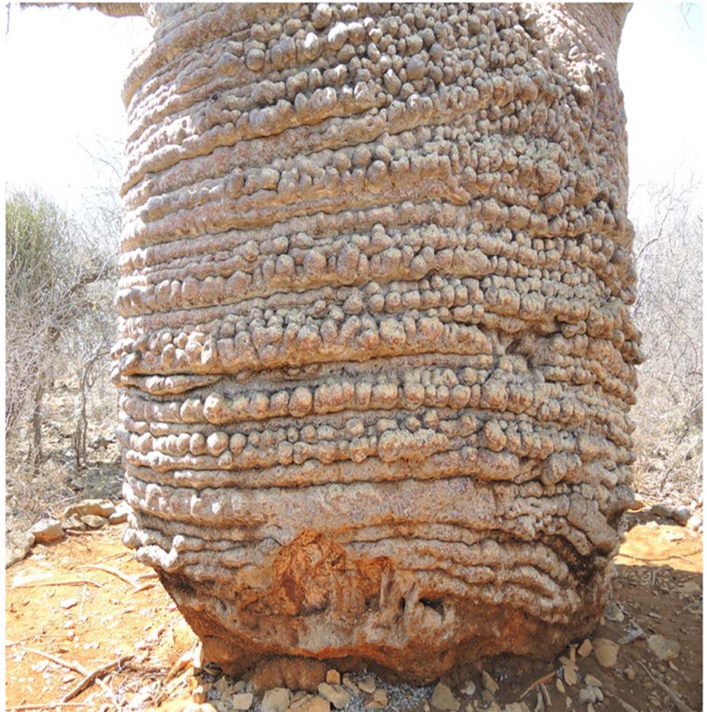
Fig 3. The strange looking tri-stemmed trunk of the Grandmother showing its various sized bulbous formations.