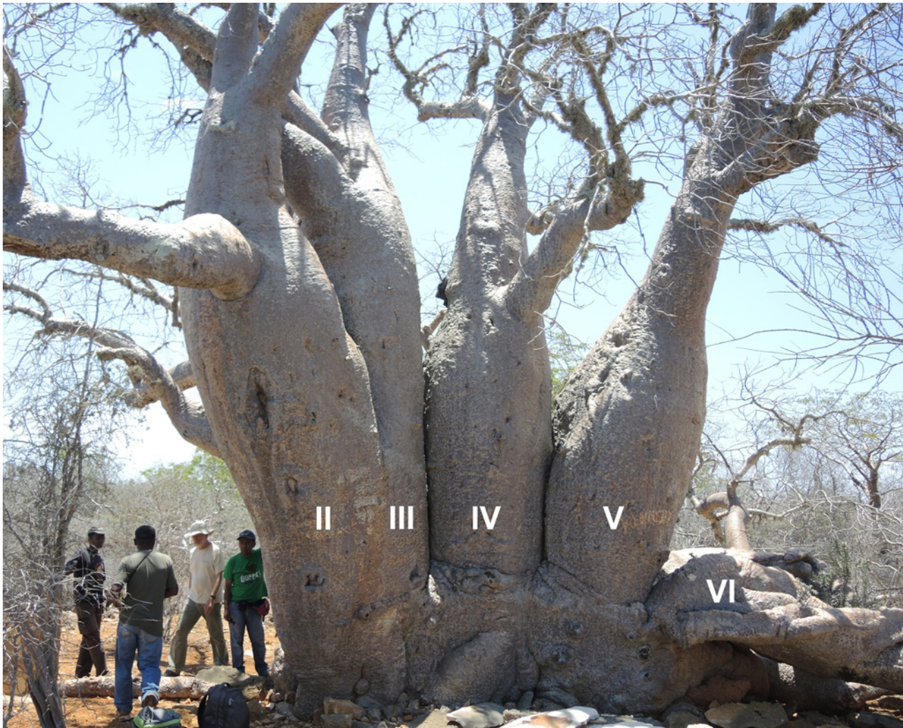
Fig 6. Eastern view of the polygamous baobab with stem numbering.